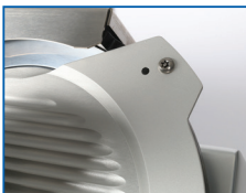
Tamper-proof Torx® screws