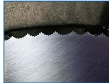
Double serrated knife front