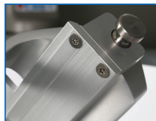
Non-removable slide rod