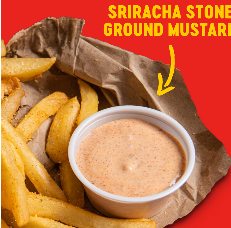
SRIRACHA STONE GROUND MUSTARD

IRI, MULO, L52 w/e 8/4/19—Based on dollar sales