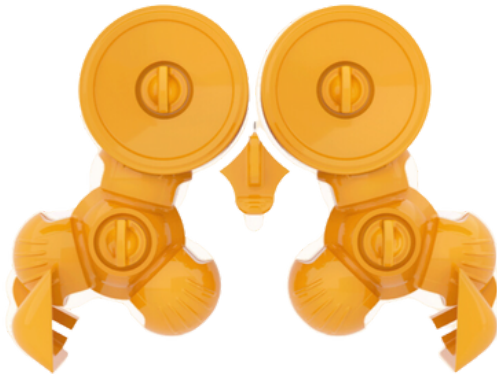
Ref. 10840 Kit M Essential Pro From 65 to 81 mm. Suitable for processing lemons, oranges and grapefruit. Standard on models: Essential Basic/Pro Versatile Basic / Speed Pro / Speed Up