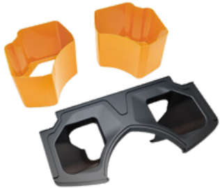
Ref. 04825 Countertop Kit Connecting to the bottom of the machine it directs waste to the waste bucket under the counter.