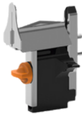
Ref. 00536 Dynamic Cutting System Processes tender or cold citrus fruits, even fruits with tougher skins..