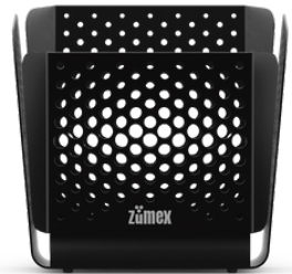
Ref. 06953 Premium basket Soul S2 For storing fruit next to your juicer or juice extractor. Up to 26 lbs. capacity.