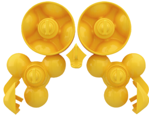
Ref. 10014 Kit S Essential Pro From 45 to 65 mm. For small fruit. Suitable for juicing limes, lemons, mandarins and small oranges *For small citrus fruits.