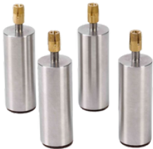
Ref. 05230 Elevation Kit Set of legs to keep the machine elevated and facilitate cleaning.