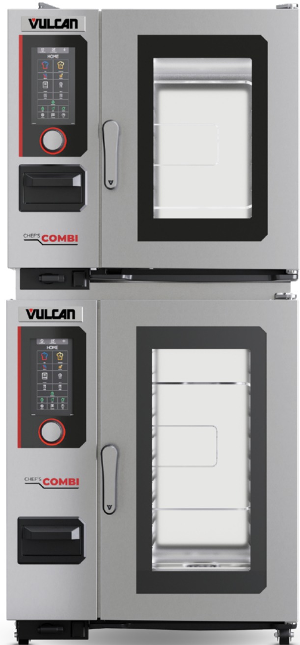
CHEF-101 stacked on CHEF-61