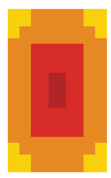
COMPETITOR HEAT STRIP