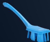
UST Long-Handled Hand Brush, Stiff Art. no: 4196x