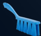
UST Bench Brush, Medium Art. no: 4585x