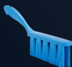
UST Bench Brush, Soft Art. no: 4581x