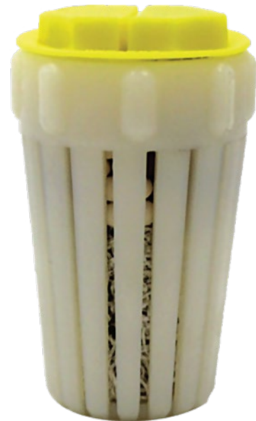
Actual Size: 2" x 3.375"