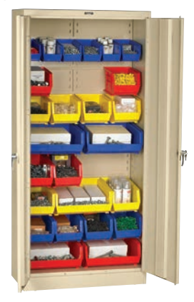
Bin boxes sold separately by other suppliers.