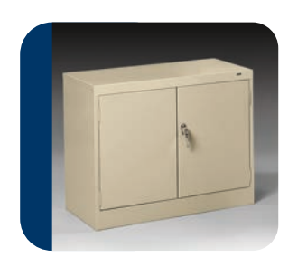
Fully Welded/Assembled Cabinets are ready for immediate use.