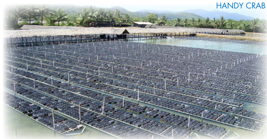
HANDY CRAB FARM

From the crystal clear waters of Southeast Asia, Handy brings delectable soft crabs, a worldwide favorite for their sweet, flavorful white meat. Our Mangrove Crabs (Scylla Serrata) are packed on site, where Handy introduced modern food technology to the Asian crab industry. Handy crabs "for all seasons" are truly always in season from year round supply to year round appeal on menus. The menu applications and recipe possibilities are endless and are a culinary chef's dream. Visit our website at www.handyknowscrab.com for great recipe suggestions.