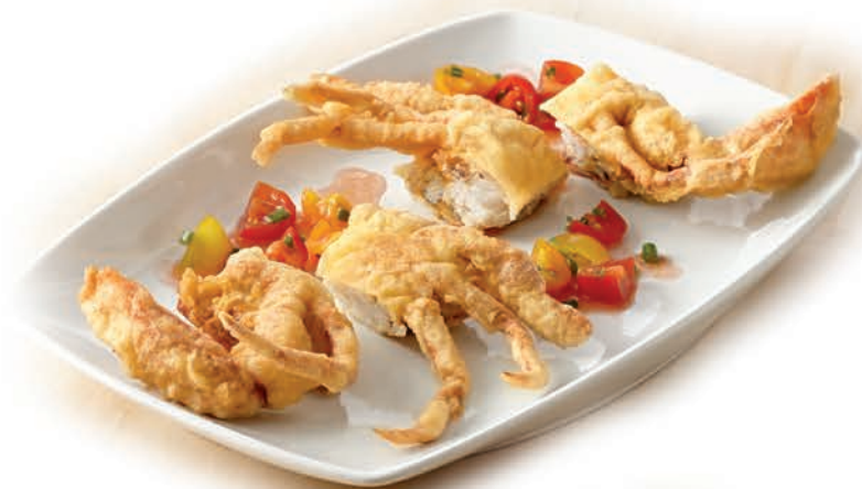
APPETIZER - SMALL PLATE