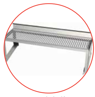
Backshelf Rear back shelf used to keep food warm. Fajita style also available. NSF approved, all stainless steel frame.