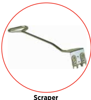
Scraper Custom made scraper to fit the shape of the top grids. Specify top grid type when ordering.