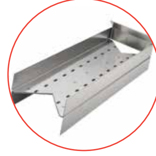
Smoker Box Kit Water tubs required with this option. Unit must have service shelf. Smoker box shovel included in kit.

Stands available for APM & CM models.APM stand is 24" high for 36" working height.CM stand is 21" high for 36" working height.