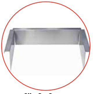
Slip On Covers Stainless steel covers for easier cleaning of splash guards. Dishwasher safe. Available only for FM and CM models.