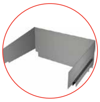
Extensions Stainless steel side and back extensions. For all MagiKitch'n charbroilers. 6" high.