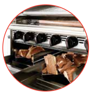
Smoker Box Kit Provides smoke flavor to food while cooking with gas. Provides controlled cooking that uses less wood than traditional methods. Available on FM and CM models only.