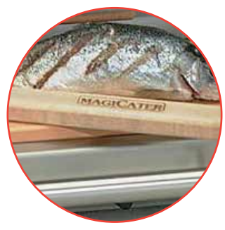
Cutting Boards Available on all charbroilers with a 10" or 12" service shelf. Specify length.

MagiCoals Ceramic briquettes. These coals will provide more infrared heat for faster broiling. They must be used in all ceramic coal MagiKitch'n charbroilers and will improve the performance of any charbroiler.