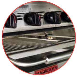
Lower Rack Optional for the CM and FM Series 600