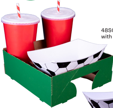
48SOCR100 with Tray 30SOCR300

Stadium-Ready Versatility – Drinks + Food, all in one trip Secure, Sturdy Design – Built for busy crowds Hot or Cold Foods – Perfect for fan favorites Stack. Store. Serve. – Easy assembly