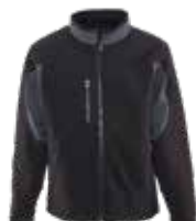
0490: INSULATED SOFTSHELL JACKET