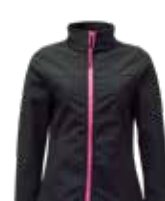
0498: WOMEN'S SOFTSHELL JACKET