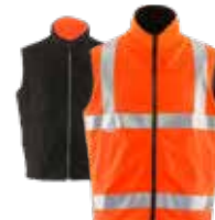
9499: HIVIS REVERSIBLE SOFTSHELL VEST