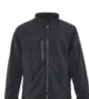
0491: SOFTSHELL JACKET