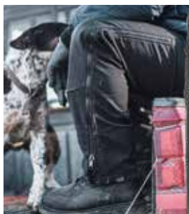
Non-locking above-knee leg zippers with secure snap at ankle