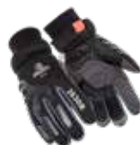
2630: WOMEN'S INSULATED SOFTSHELL GLOVE