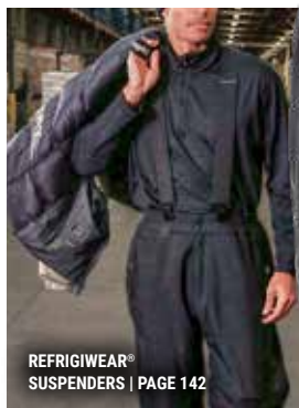
REFRIGIWEAR® SUSPENDERS | PAGE 142