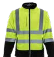
9291: HIVIS SOFTSHELL JACKET