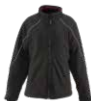
0493: WOMEN'S INSULATED SOFTSHELL JACKET