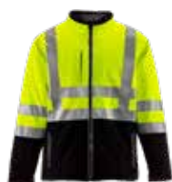
0496: HIVIS INSULATED SOFTSHELL JACKET