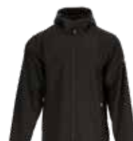
9151: LIGHTWEIGHT SOFTSHELL JACKET WITH HOOD