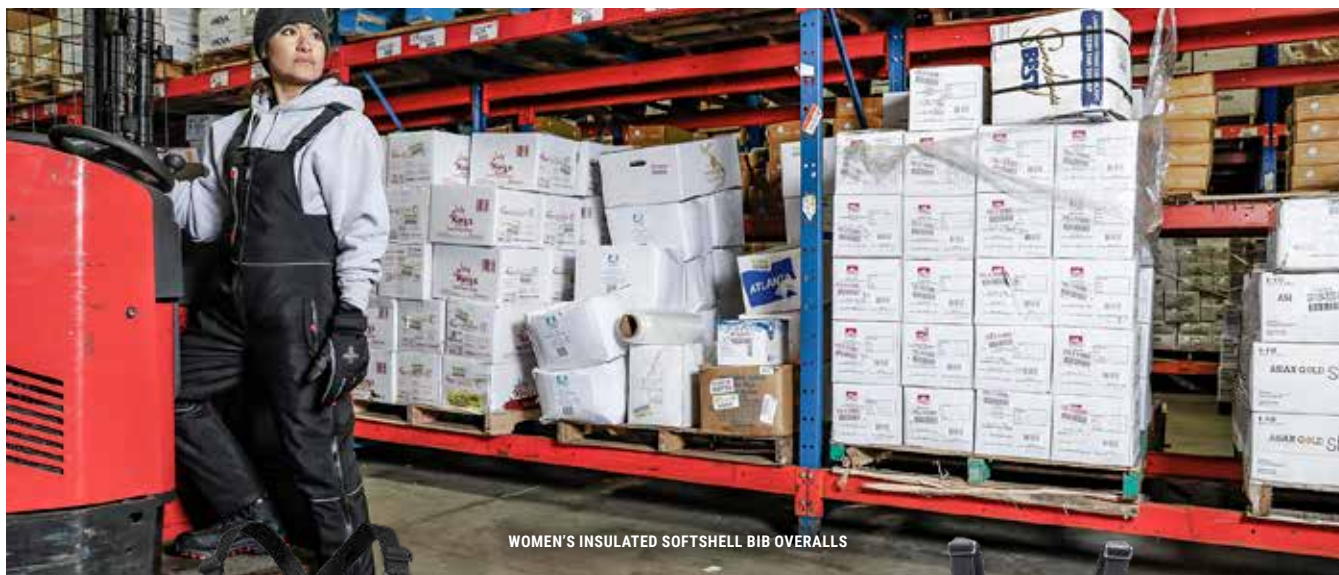
WOMEN'S INSULATED SOFTSHELL BIB OVERALLS