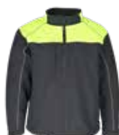
8220: TWO-TONE HIVIS INSULATED SOFTSHELL JACKET