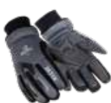
2631: INSULATED SOFTSHELL GLOVE