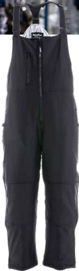
HIVIS INSULATED SOFTSHELL BIB OVERALLS

Our Softshell Bib Overalls have a high torso and back to keep your core protected. With that added warmth, you can pair them with one of our heavy-duty sweatshirts and be ready for the day's work. With black, HiVis and enhanced-visibility and women's options, we have Softshell Bib Overalls for everyone.