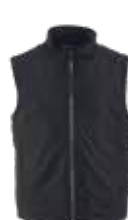
0494: SOFTSHELL VEST