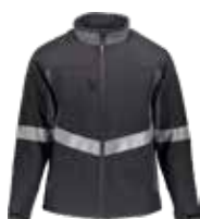
8490: ENHANCED VISIBILITY INSULATED SOFTSHELL JACKET