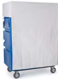
R&B ID: 740W

White vinyl cover for 747/PTB Turnabout Bumper Truck