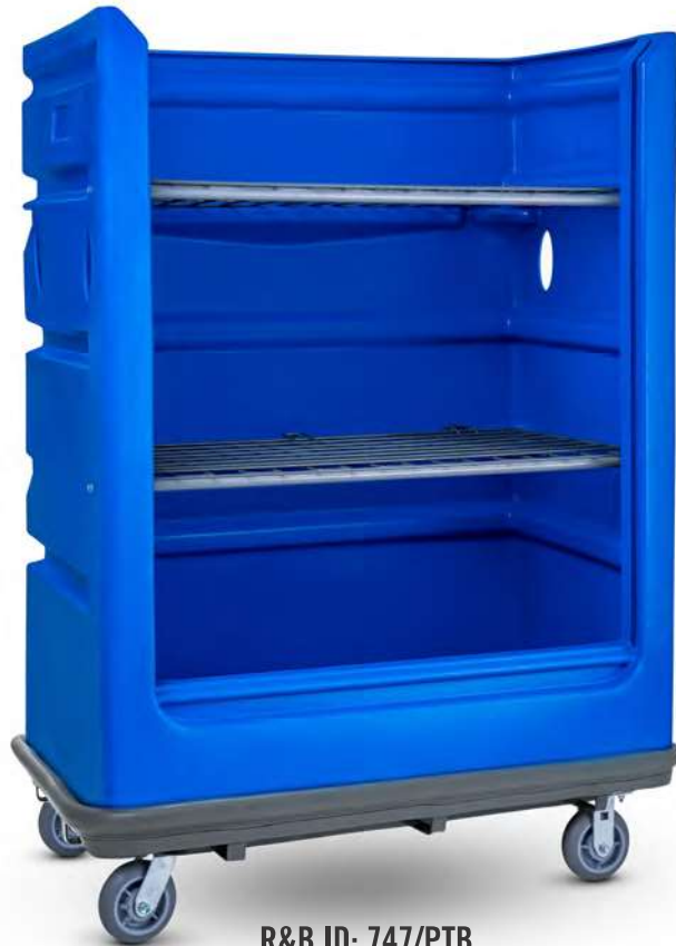
R&B ID: 747/PTB