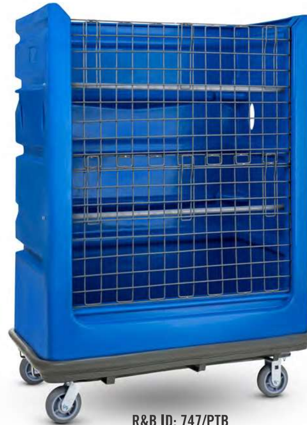
R&B ID: 747/PTB

White vinyl cover for 747/PTB Turnabout Bumper Truck