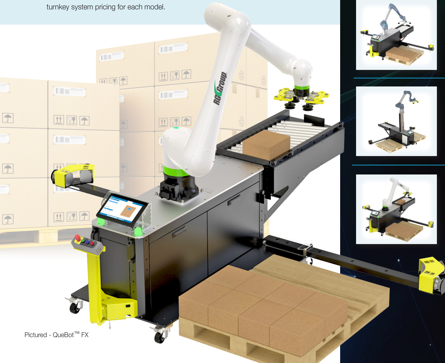
Pictured - QueBot™ FX

Choose from four pre-engineered Palletizing configurations to meet your payload, reach and rate requirements. QueBot™ palletizing cells are ready to purchase, delivering in just a few weeks and can be deployed the day you receive them. No prior programming experience is necessary. If you do have special integration requirements, please contact us. We offer turnkey system pricing for each model.