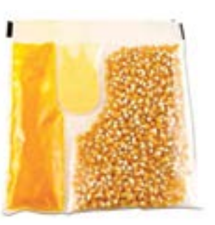
Portion Pack available in 6 oz, 8 oz, 12 oz