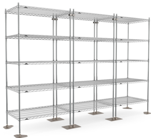
Metro Super Erecta® End-to-end configuration

PROTECTION THAT LIVES ON MICROBAN ANTIMICROBIAL PRODUCT PROTECTION