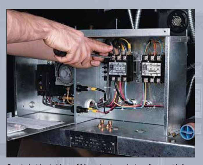
Electrical wiring in Master-Bilt® condensing units is easily traceable for the installer.

Experience has taught us how to build the best systems for our customers. A solid commitment to quality, improvement and technological advancement ensures our continued ability to meet their high expectations.