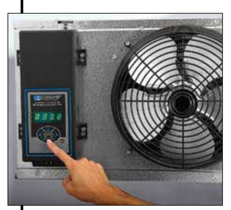
The Master Controller Reverse Cycle Defrost interface is mounted to an evaporator coil.

The Master Controller Reverse Cycle Defrost (MCRCD) system is an electronic controller for Master-Bilt® walk-in cooler and freezer refrig-