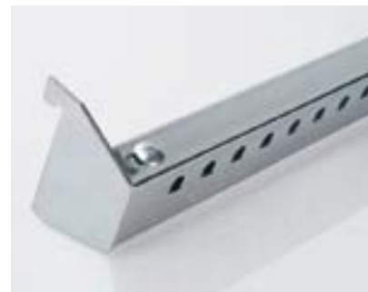
Upscale Magna-Bar has preassembled brackets