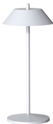
Pirlo White Rechargeable Lamp LMPPIRWHT300 L 11" W 5 1/4" H 11"