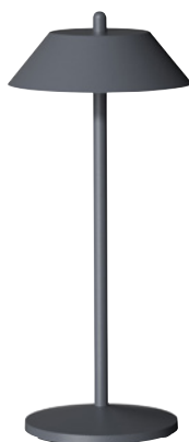
Pirlo Dark Gray Rechargeable Lamp LMPPIRGRY300 L 11" W 5 1/4" H 11"