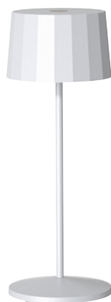
Octa White Rechargeable Lamp LMPOCTWHT300 L 11 1/4" W 4 3/8" H 11 1/4"