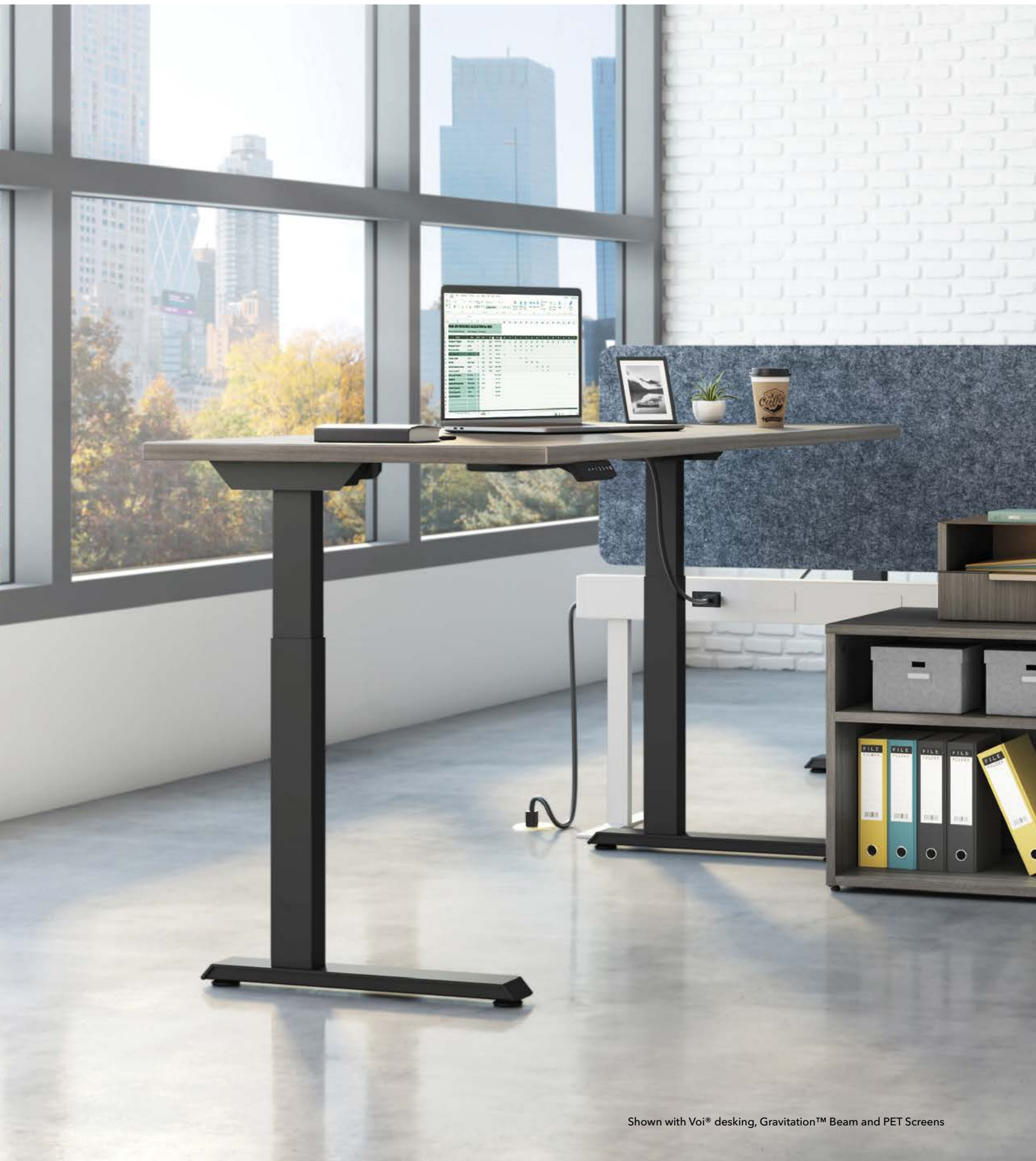
Shown with Voi® desking, Gravitation™ Beam and PET Screens