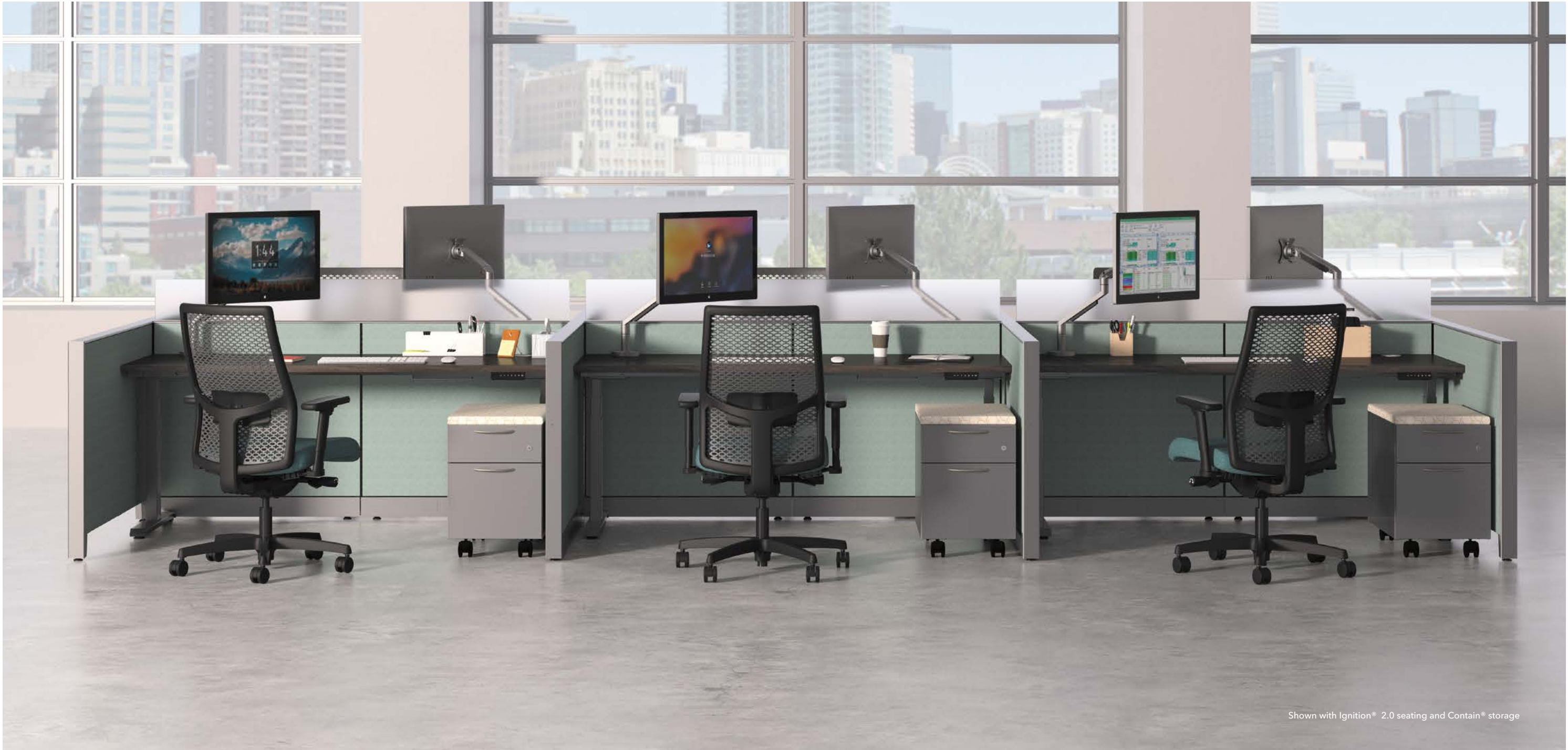
Shown with Ignition® 2.0 seating and Contain® storage

Change Of Pace Add variety to your work life with a 2-leg base with a rectangle worksurface or a 3-leg base with a corner cove worksurface that ranges from 21 ¾"H to 47 ½"H.