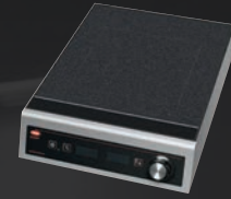
Boxer® Induction Ranges MODEL IRNG-BXC1-18 SHOWN