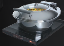
Palletti® Induction Warmers MODEL IW/RM-C1-1317-06 SHOWN