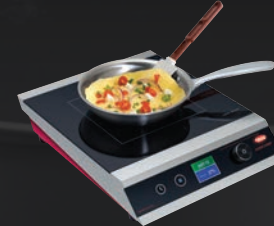
Rapide Cuisine® Induction Ranges MODEL IRNG-PC1-18 SHOWN