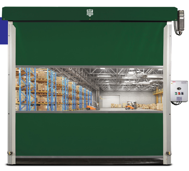
10' x 10' door pictured with green & vision panels