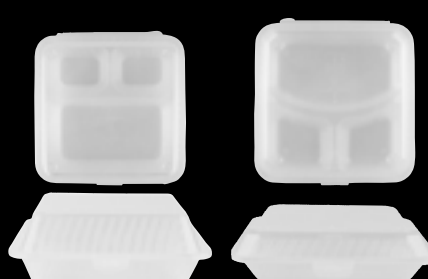
EC-09-1-CL 3-Compartment Entrée 9" L x 9" W x 3.5" H 1 dz