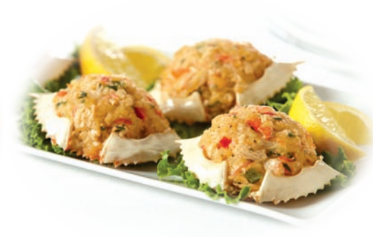
Mini Stuffed Shells