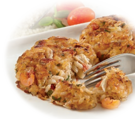
Crab & Shrimp Risotto Cakes