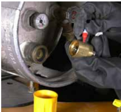
ADD GLUE TO COUPLER AND SAFETY GRIP