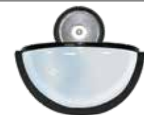
Magnetic Dome Mirror

Ideal Warehouse Innovations' Side Magnetic Mirror provides a side-view of the operator's surroundings for safety and can mount anywhere in the operator's compartment in seconds using the magnetic arm attachment.