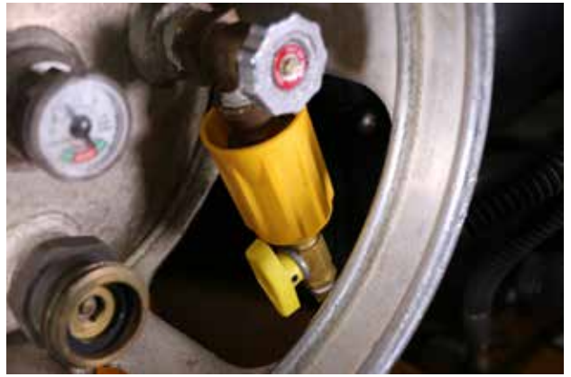
QUICK CHANGE PROPANE VALVE IN-USE