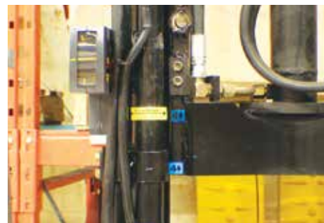
Correct pallet Height for Entry and Exit of Pallet