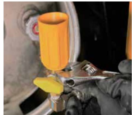
INSTALL COUPLER ON PROPANE VALVE WITH A WRENCH