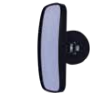
Side Magnetic Mirror