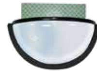
Tape Dome Mirror