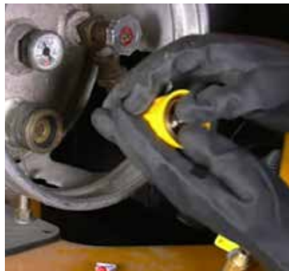
PUSH COUPLER THROUGH SAFETY GRIP