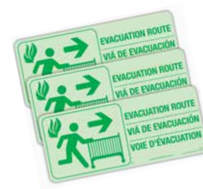
Evacuation Route Signs 1963006

Caregivers learn safe methods to prepare for successful evacuation