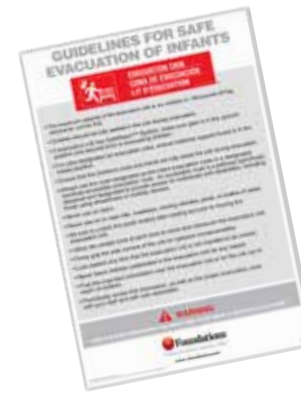
Evacuation Training 1964006

Caregivers learn safe methods to prepare for successful evacuation