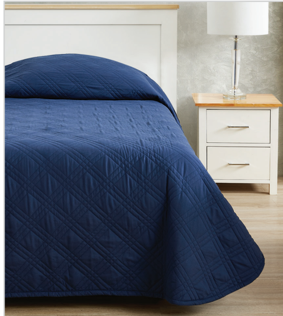
Throw Style Bedspread

76" x 110" Rounded corners prevents excessive draping