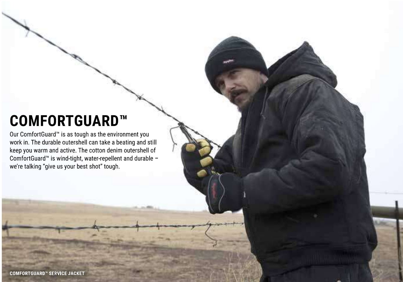
COMFORTGUARD™ SERVICE JACKET

Our ComfortGuard™ is as tough as the environment you work in. The durable outershell can take a beating and still keep you warm and active. The cotton denim outershell of ComfortGuard™ is wind-tight, water-repellent and durable – we're talking "give us your best shot" tough.