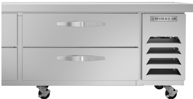
Optional overhang top (up to 6-inches on either side)