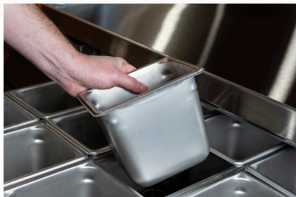
ACCOMMODATES 6" PANS IN top and bottom drawers