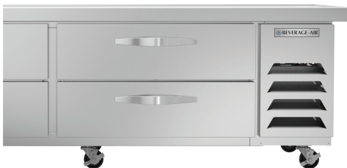
Optional overhang top (up to 6-inches on either side)