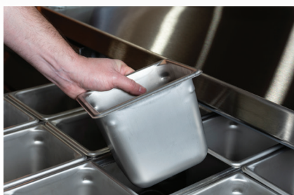
ACCOMMODATES 6" PANS IN top and bottom drawers