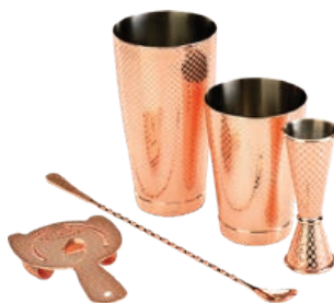
Copper Plated M37206CP