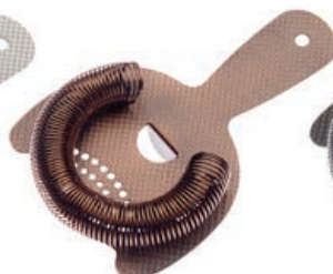
Antique Copper M37203ACP