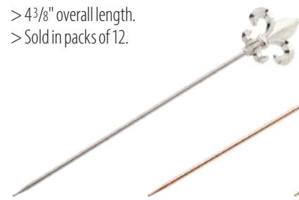
Stainless Steel M37208