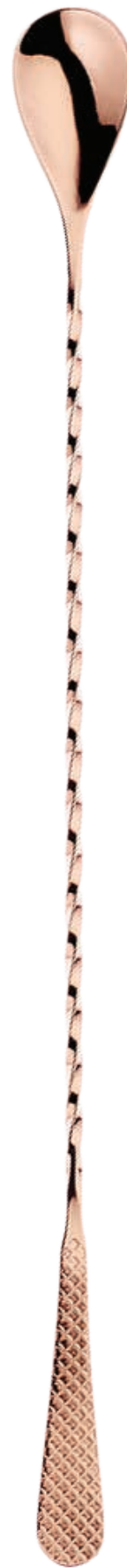
Copper Plated M37204CP