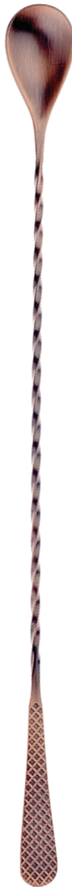
Antique Copper M37204ACP