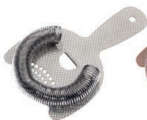
Stainless Steel M37203