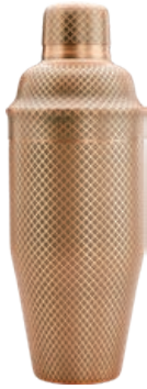
Antique Copper M37205ACP