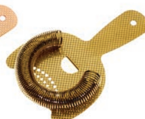
Gold Plated M37203GD