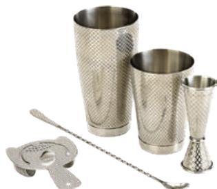
Stainless Steel M37206