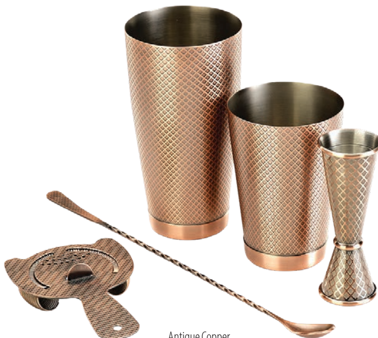
Antique Copper M37206ACP