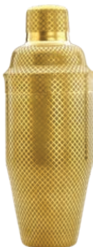
Gold Plated M37205GD