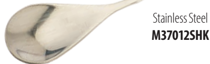
Stainless Steel M37012SHK