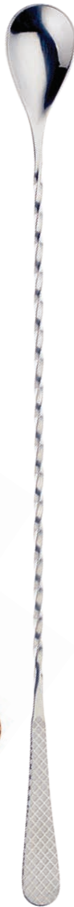
Stainless Steel M37204