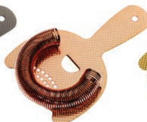
Copper Plated M37203CP