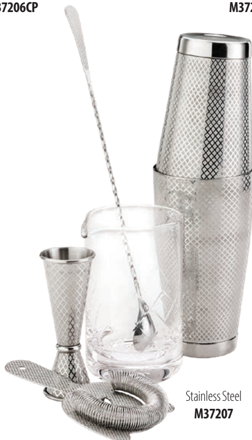
Stainless Steel M37207