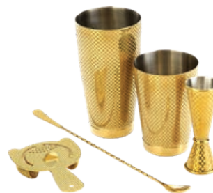
Gold Plated M37206GD