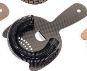
Gun Metal Black M37203BK