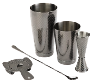
Gun Metal Black M37206BK