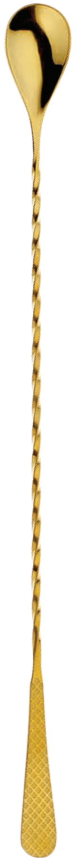
Gold Plated M37204GD