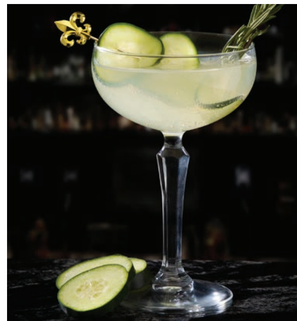
Gold Plated M37208GD