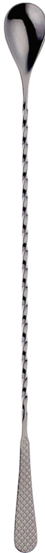
Gun Metal Black M37204BK