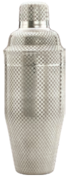
Stainless Steel M37205