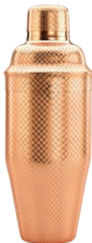
Copper Plated M37205CP