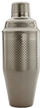
Gun Metal Black M37205BK