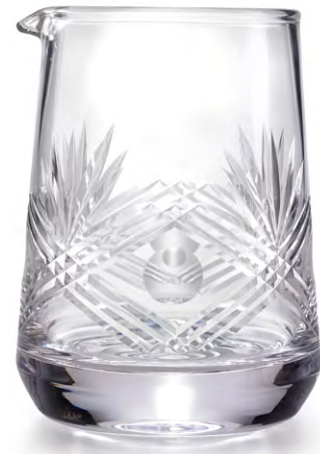
25 oz. M37175

For use with 15 3 / 4 " (40cm) spoons and spring strainer. Three drink capacity. 4" (10.2 cm) diam. x 6 1 / 4 " (15.9 cm) h.