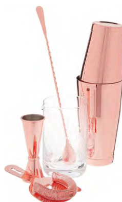
M37131CP Copper Plated