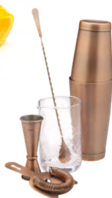
M37131ACP Antique Copper