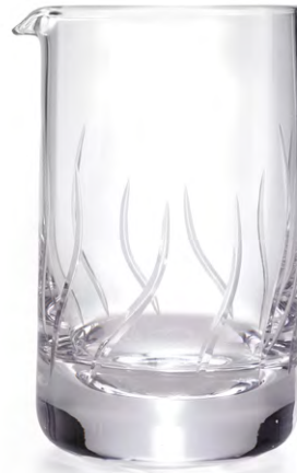
17 oz. M37173

For use with 11 13 / 16 " (30cm) spoons and julep and spring strainers. Two drink capacity. 3 3 / 4 " (9.5 cm) diam. x 5 1 / 2 " (14.0 cm) h.