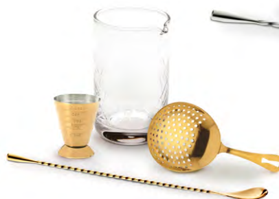
M37132GD Gold Plated