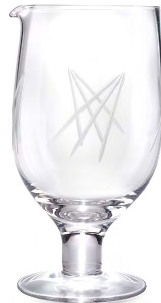
27 oz. M37176

For use with 15 3 / 4 " (40cm) spoons and julep and spring strainer. Three drink capacity. 4" (10.2 cm) diam. x 7 1 / 2 " (19.1 cm) h.