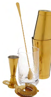
M37131GD Gold Plated