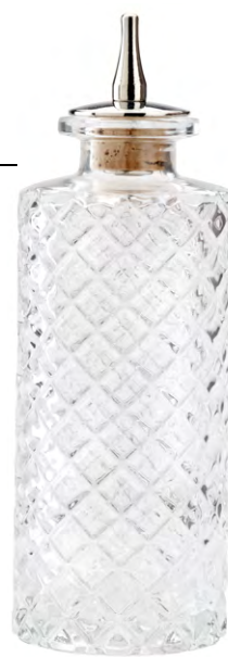
5.1 oz. M37172