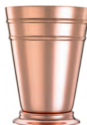
M37168CP Copper Plated