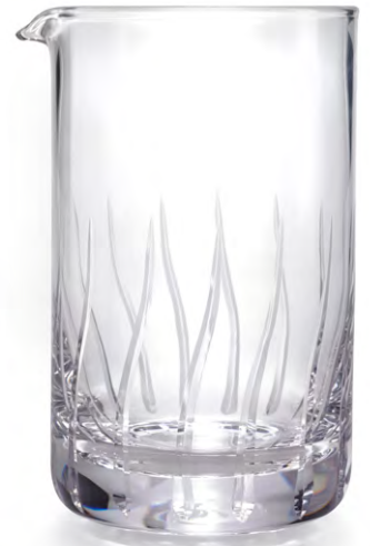
24 oz. M37174