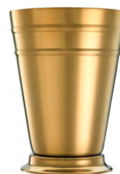
M37168GD Gold Plated