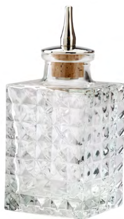
3 oz. M37171

Capacity 5.1 oz. (150ml) 2 1/8" diam. x 6 1/4" h.