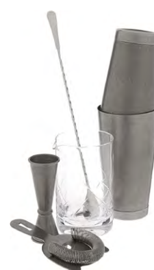
M37131VN* Vintage *Bar Spoon is stainless steel