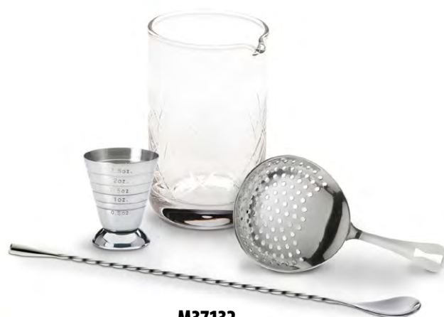
M37132 Stainless Steel