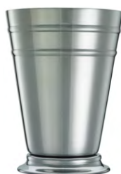
M37168 Stainless Steel