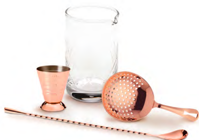
M37132CP Copper Plated