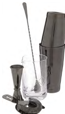
M37131BK Gun Metal Black