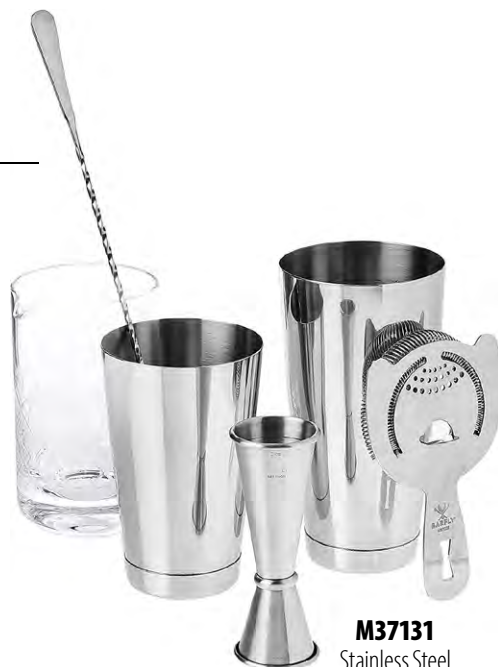
M37131 Stainless Steel