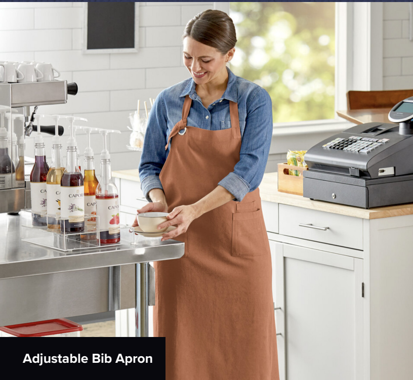
Adjustable Bib Apron