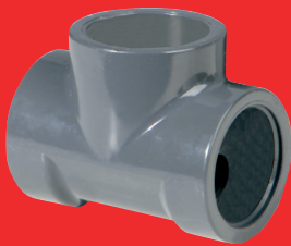
All Units include flow control, shipped inside.