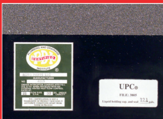
PDI Certified, IAPMO and UPC listed.