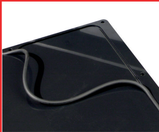
"D" Ring gaskets on covers.