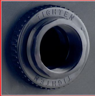
Serviceable Bulk Head Fittings available in 2" and 3".