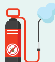
Fumigants: Methyl Bromide