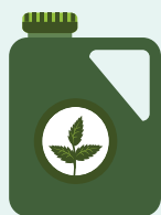
Herbicides: Glyphosate, Paraquat and Diquat