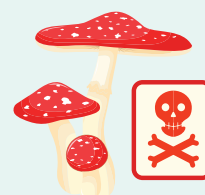
Fungicides: Calcium Polysulfide, Captafol and Captan