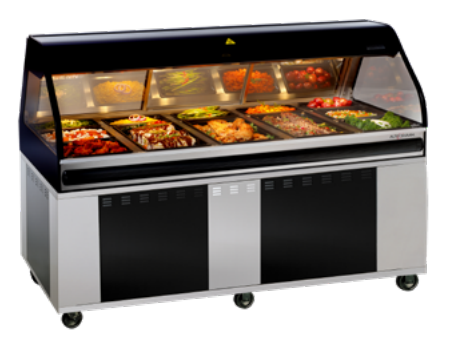
Mobile Base (Short Height)