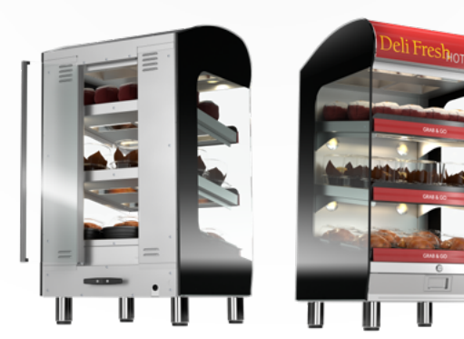
* Swing Back Door Optional