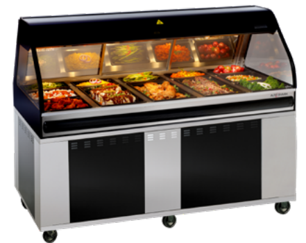
Mobile Base (Standard Height)