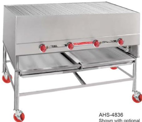
AHS-4836 Shown with optional stand and casters.