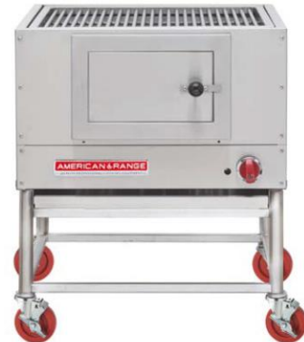
AMSQ-30 Shown with optional stand and casters.