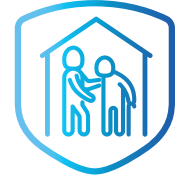
Long Term Care