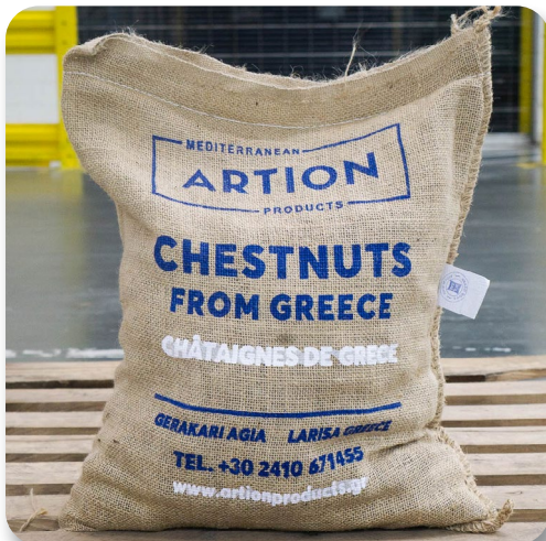
Bulk Chestnut Sack