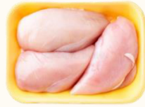
Animal Chicken Breast

Beyond Chicken Pieces have LESS SAT FAT than the leading animal competitor and MORE PROTEIN than PB competitors