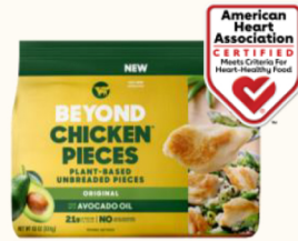
Beyond Meat Chicken Pieces