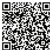
ecoSchwank Installation Manual