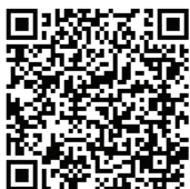
ecoSchwank 36, 52 Installation Manual