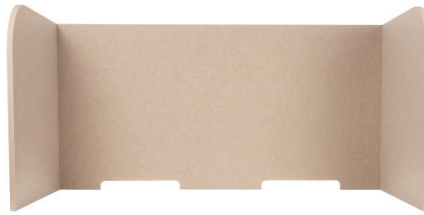
SOUNDSORB TRI-FOLD DESKTOP PRIVACY PANEL