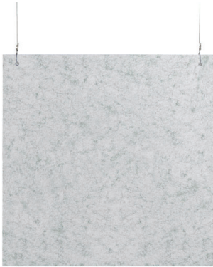
HANGING SOUNDSORB ACOUSTIC PANELS