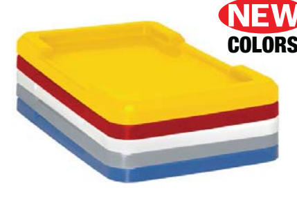
LID2516-8 Optional lid keeps stored items dust free. Tubs can still stack or cross stack with lids in place.