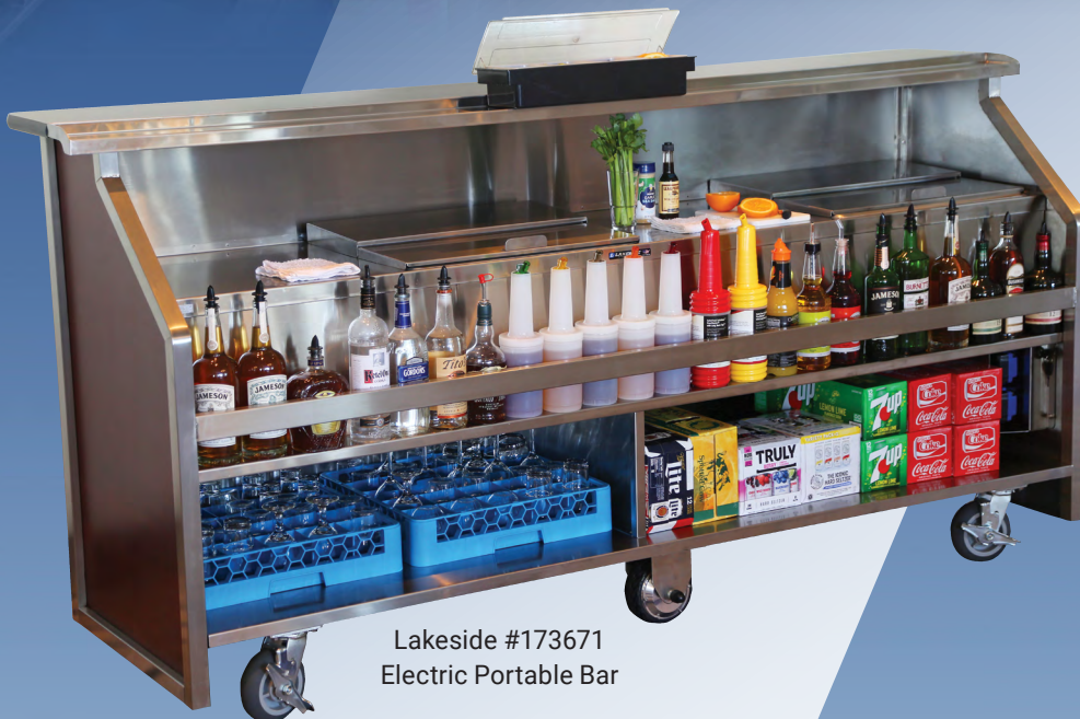
Lakeside #173671 Electric Portable Bar