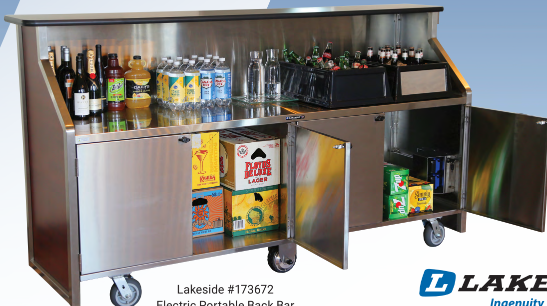
Lakeside #173672 Electric Portable Back Bar