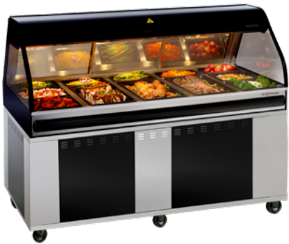
Mobile Base (Standard Height)