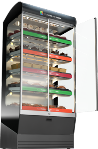
Shown with custom graphics & Front Door Option

CAPACITY Five (5) 32-7/8" (835mm) wide shelves, Eight (8) chicken boats with dome covers per shelf.