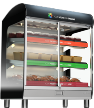
Shown with custom graphics & Front Door Option

CAPACITY Three (3) 32-7/8" (835mm) wide shelves, Eight (8) chicken boats with dome covers per shelf.