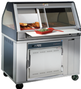
Mobile Base (Short Height)

*Shown with optional holding oven system