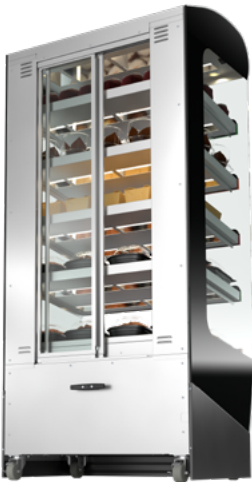
* Swing or Slide Back Door Optional