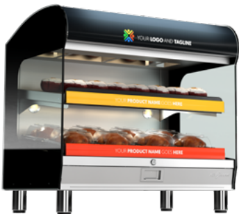
Shown with custom graphics

CAPACITY Two (2) 32-7/8" (835mm) wide shelves, Eight (8) chicken boats with dome covers per shelf.