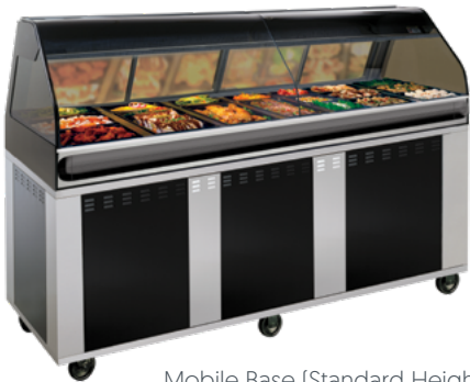
Mobile Base (Standard Height)