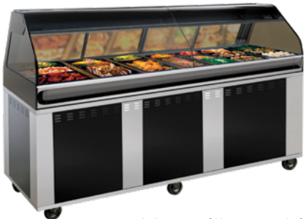
Mobile Base (Short Height)