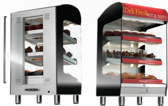
* Swing Back Door Optional

CAPACITY Three (3) 20-7/8" (530mm) wide shelves, Six (6) chicken boats with dome covers per shelf.