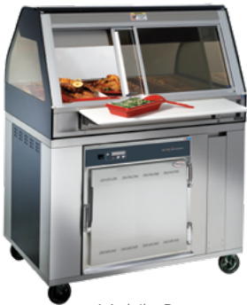
Mobile Base (Standard Height)

*Shown with optional holding oven system