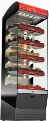
* Swing or Slide Back Door Optional

PRODUCT CAPACITY 24 lb (11 kg) per shelf