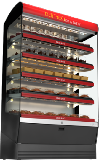
* Swing or Slide Back Door Optional

PRODUCT CAPACITY 24 lb (11 kg) per shelf