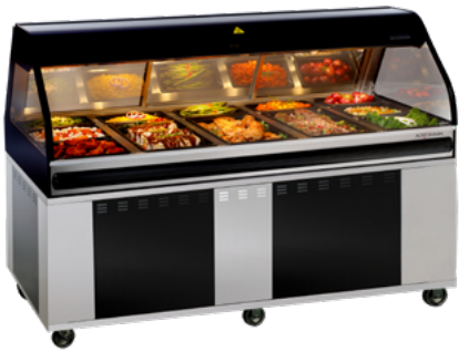
Mobile Base (Short Height)