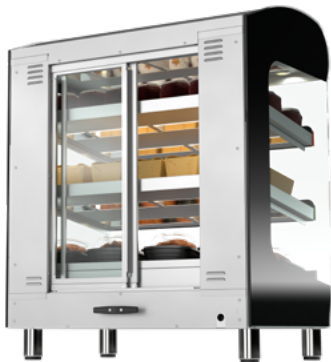
* Swing or Slide Back Door Optional

PRODUCT CAPACITY 24 lb (11 kg) per shelf