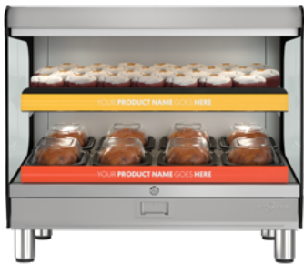
Shown with custom graphics

PRODUCT CAPACITY 24 lb (11 kg) per shelf