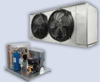
SPLIT-PAK™ REMOTE SYSTEMS INDOOR & OUTDOOR MODELS**

* Capsule Pak ECO and Capsule Pak Remote systems are intended for single compartments 14' long and under.