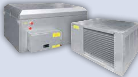
CAPSULE PAK™ REMOTE* INDOOR & OUTDOOR Quick-connect systems up to 2 HP