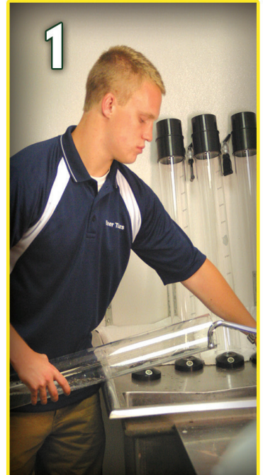
Partially fill the tube with warm water.

Cleaning the Beer Tube is a quick and simple process that can be done in about a minute. After removing the tube from the base: