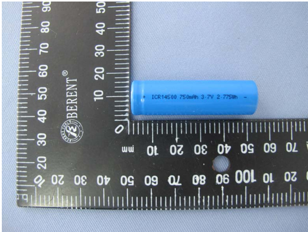
Figure 1 Top view of cell