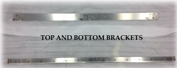
TOP AND BOTTOM BRACKETS