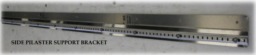
SIDE PILASTER SUPPORT BRACKET