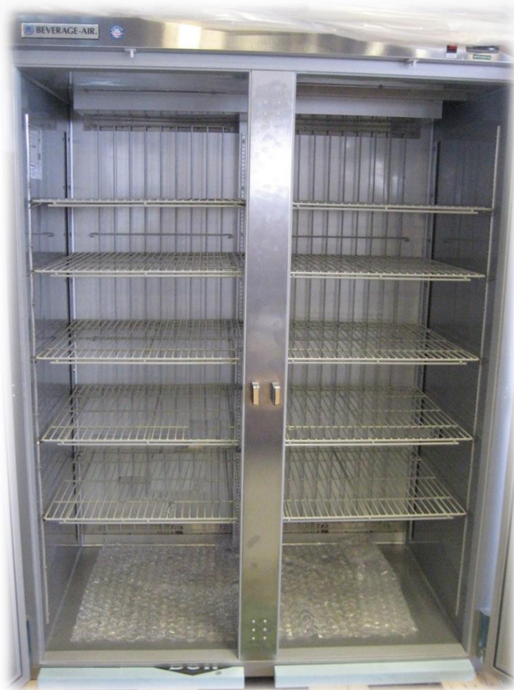
BACK SPACERS AND SHELVING INSTALLED