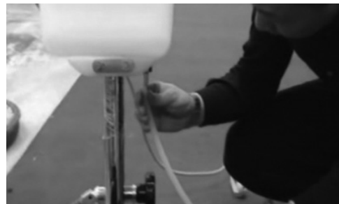
6) The water pipe connects the water tank outlet and the base