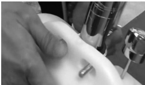
5) Install the water tank accessories and install the water tank on the handle