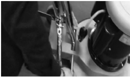
1) Put on the handle and install the axle