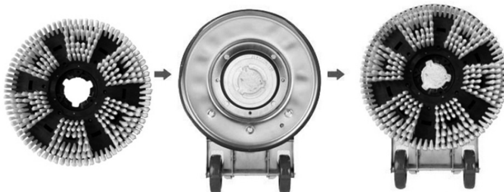
7) Align the disc brush with the bottom clasp and rotate it anticlockwise to fix it